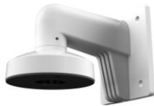
HIA-B401-110T Wall Mount