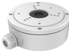
HIA-J102 Junction Box