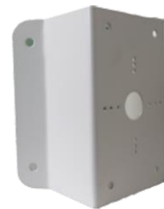
HIA-B201 Corner Mount