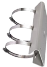
HIA-B301 Vertical Pole Mount