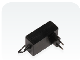
48 V 0.95 A power adapter